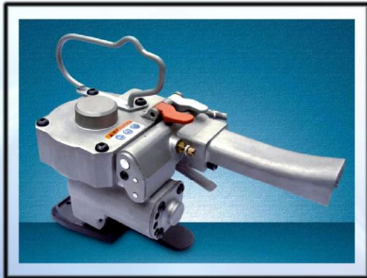
Cotton Strapping Tools A-19